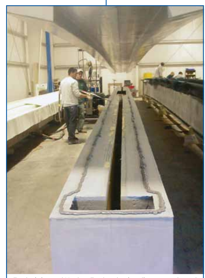
Technicians at Harbor Technologies dispense a bead of SCIGRIP SG230 HV adhesive on the composite bridge beam. The adhesive is used to structurally bond a composite top to the beam. The bulk metermix dispenser improved productivity by 50 percent.

SCIGRIP SG230 HV structural two-component adhesive was used to bond a composite top to the concrete and steel filled composite beam "box."